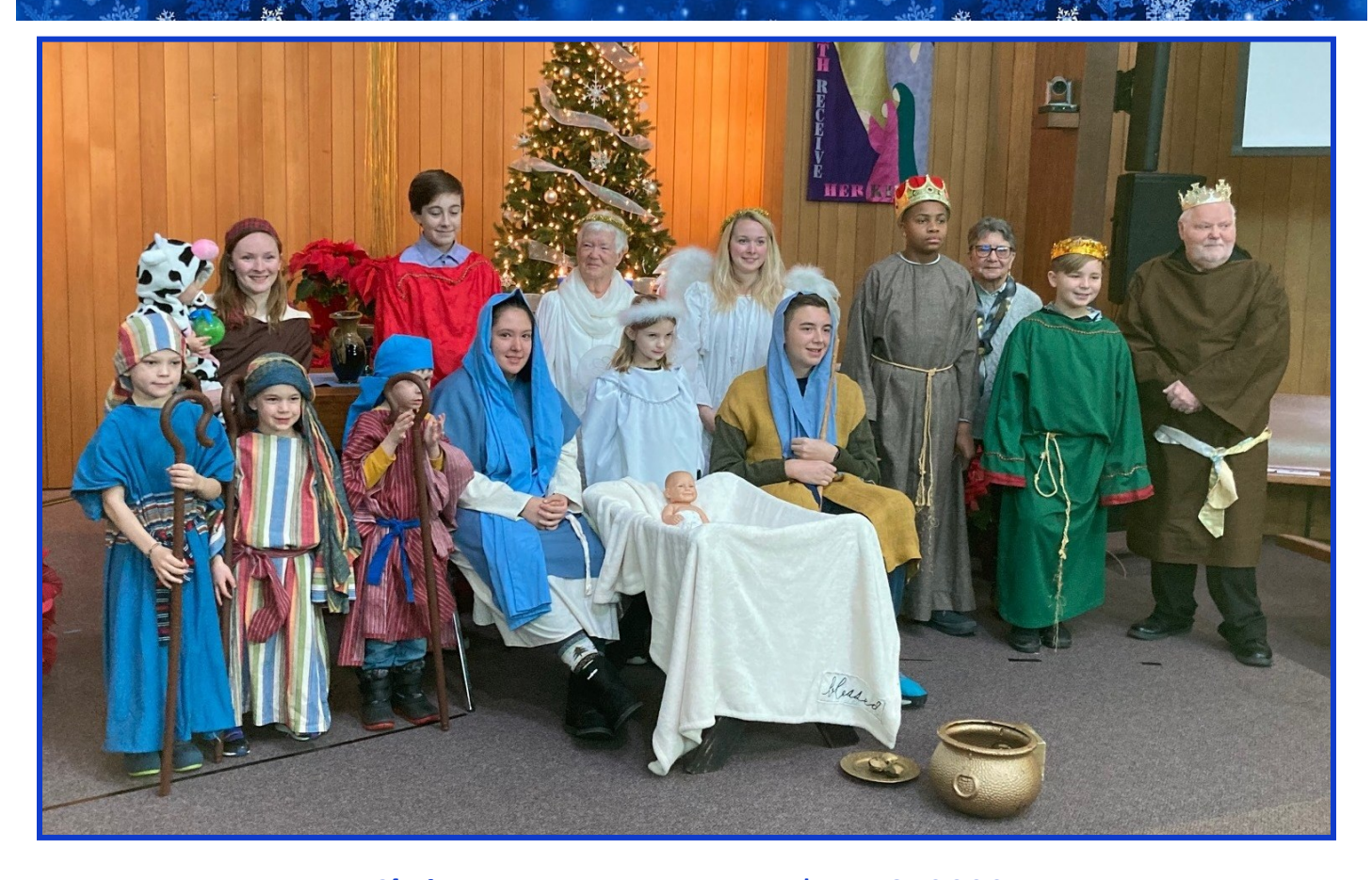
Christmas Pageant December 18, 2022