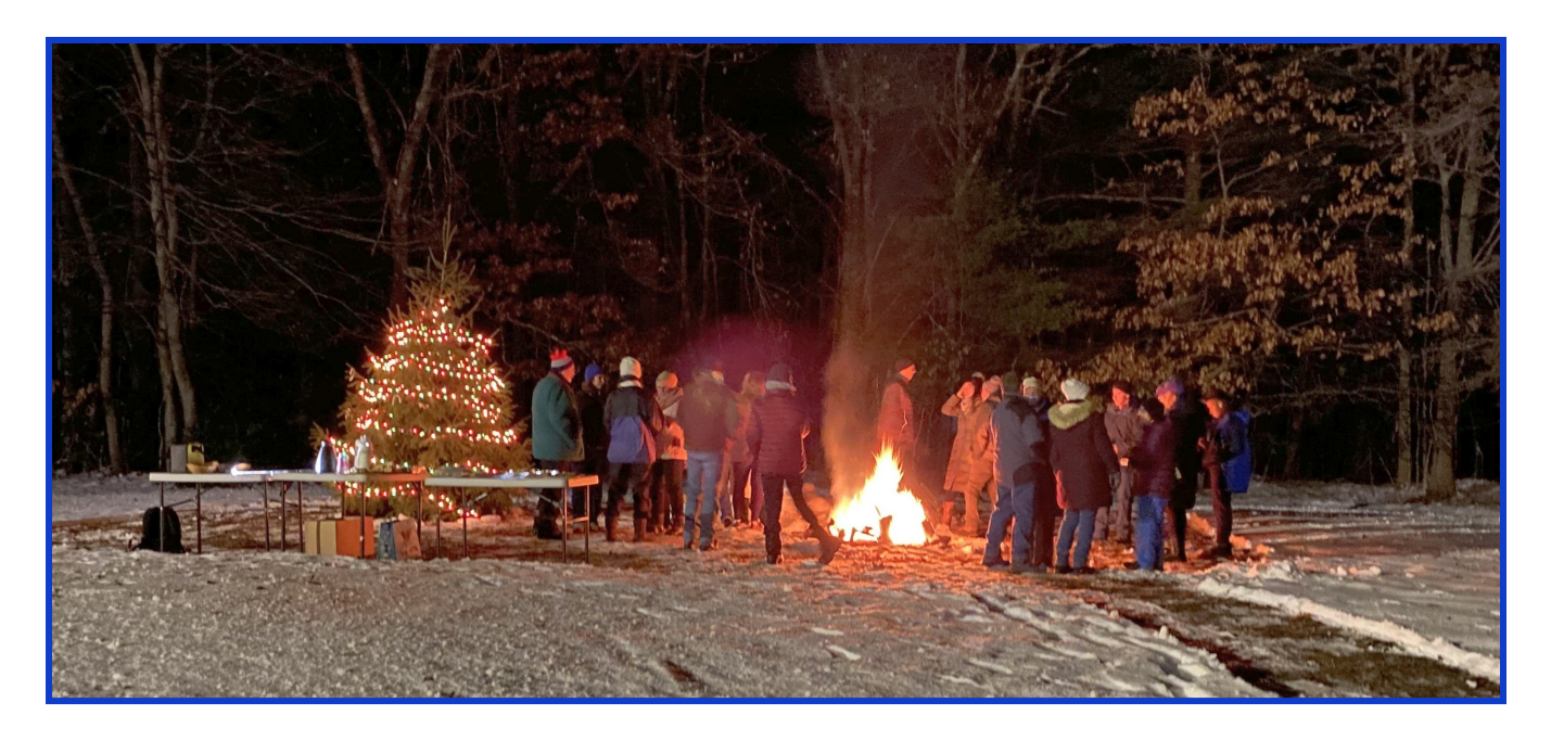
First Annual Christmaspalooza! December 18, 2022